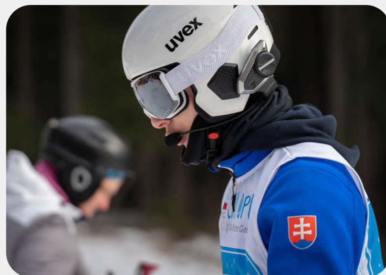
Power of motivation