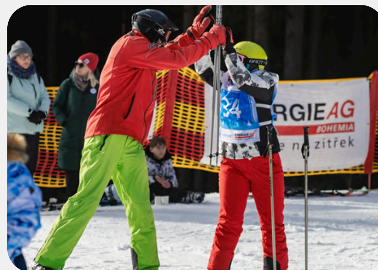
Inclusion of movement