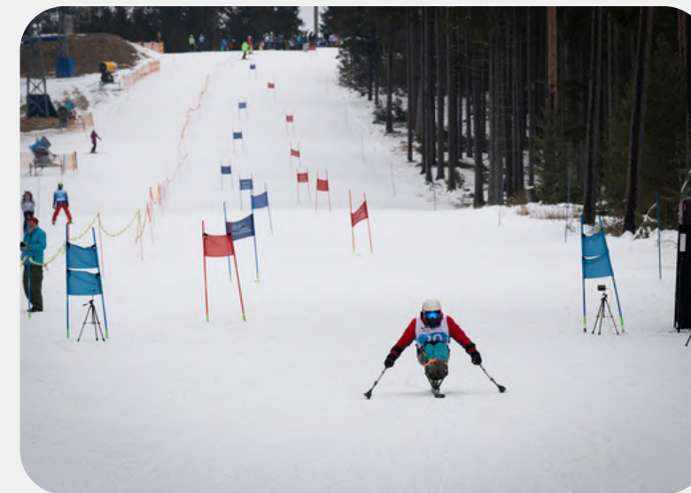
Sport for everyone